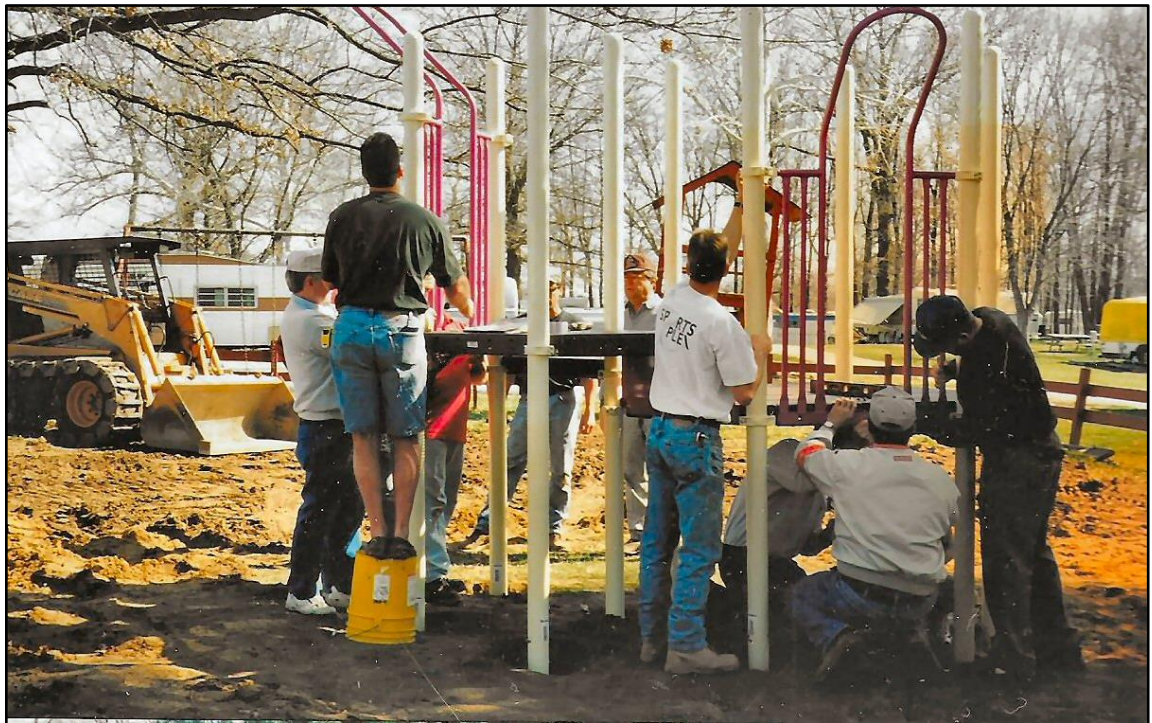
This Picture was earlier in the day when we were just getting started on the Playground Equipment. The Ruritan Members had answered the call many times to come and volunteer at the Park/Campgrounds/Turkey Trot Grounds and saved the Club large sums of money by donating their time and talents to see that projects just this were completed.