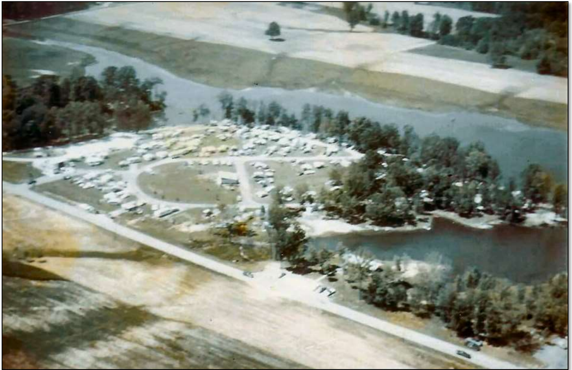
Aerial View of Campgrounds/Park/Lake: This view is looking from the south looking North West. You will note that the top of the picture is land on the north side of the lake where the Gasthof Restaurant and Motel are now located. Campgrounds appear to be at capacity and this was well before the Park Superintendent's House/Office was built. This picture would have been taken before the first Turkey Trot.