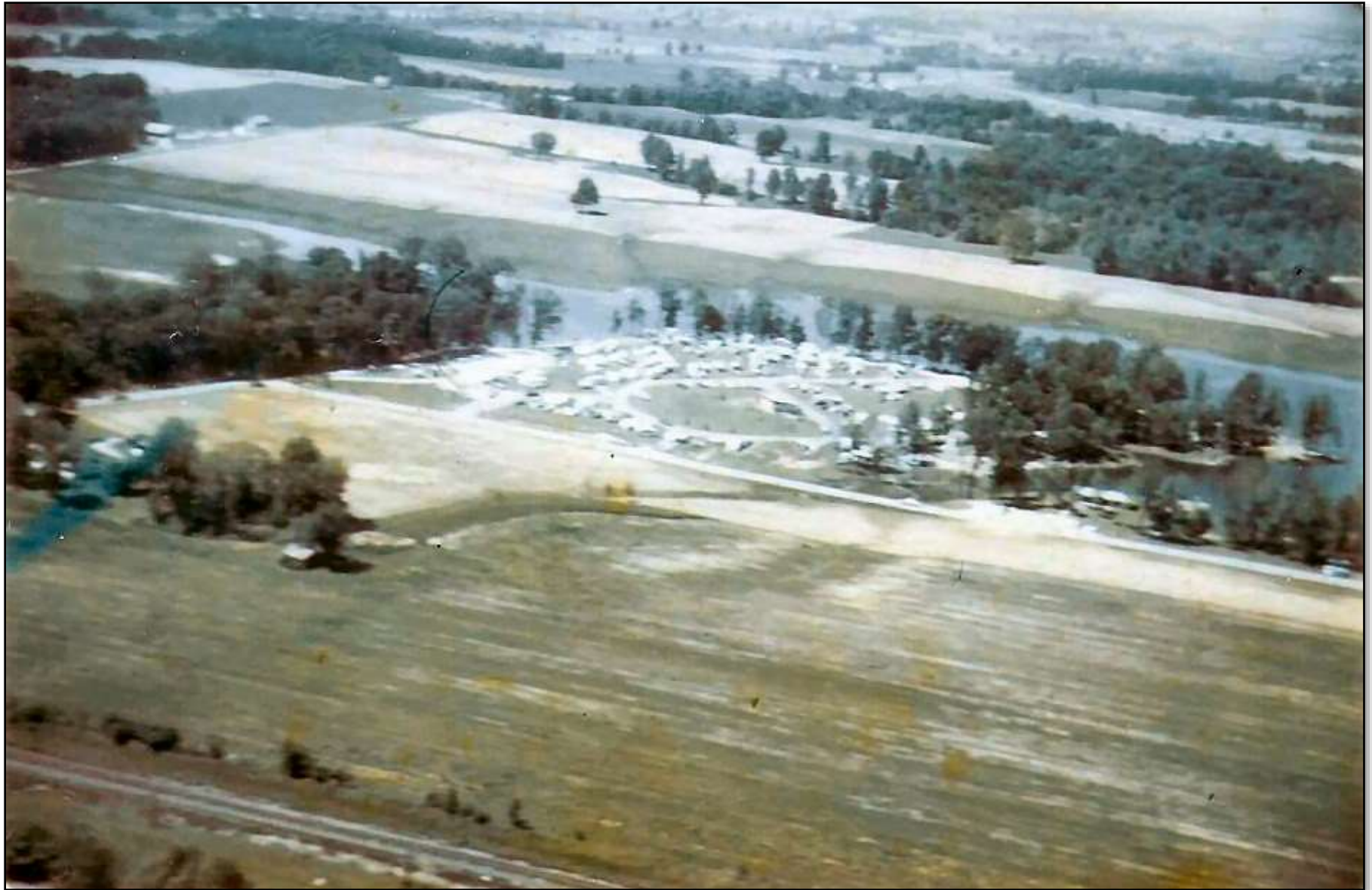
Aerial View of Campgrounds/Park/Lake: Shown here is an aerial view of the Ruritan Park, Campgrounds and Indian Rock Lake as it appeared sometime around 1970. This view is looking from the south looking North West. It was taken sometime during the summer and it may have been around the time that the Ruritan Club purchased the ground south of the CR 100 (Park Rd.) known as the Montgomery Property.