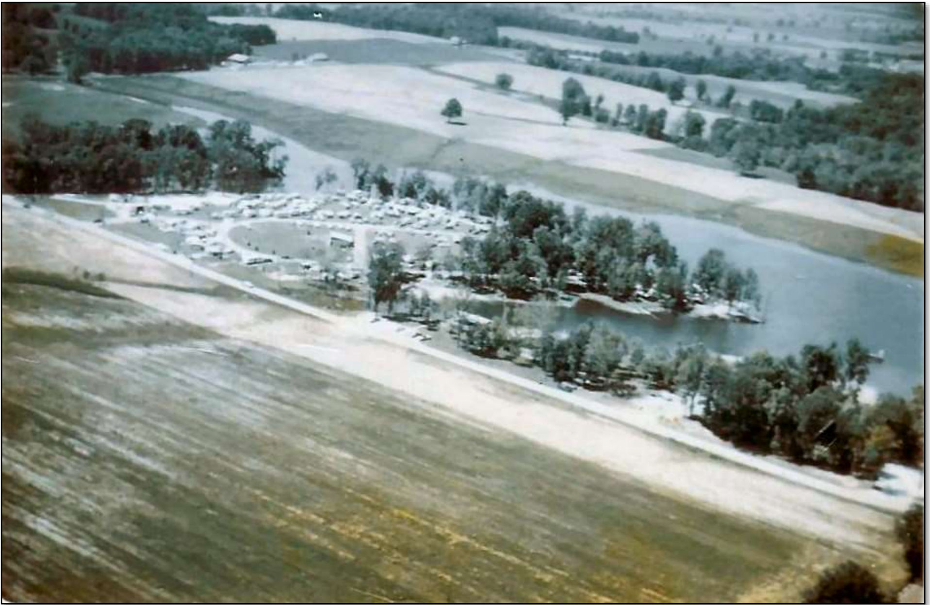
Aerial View of Campgrounds/Park/Lake: This view is looking from the Southeast looking North West. It is believed these series of pictures would have been taken around 1970 or around the time the Ruritan Club acquired the Montgomery Property.