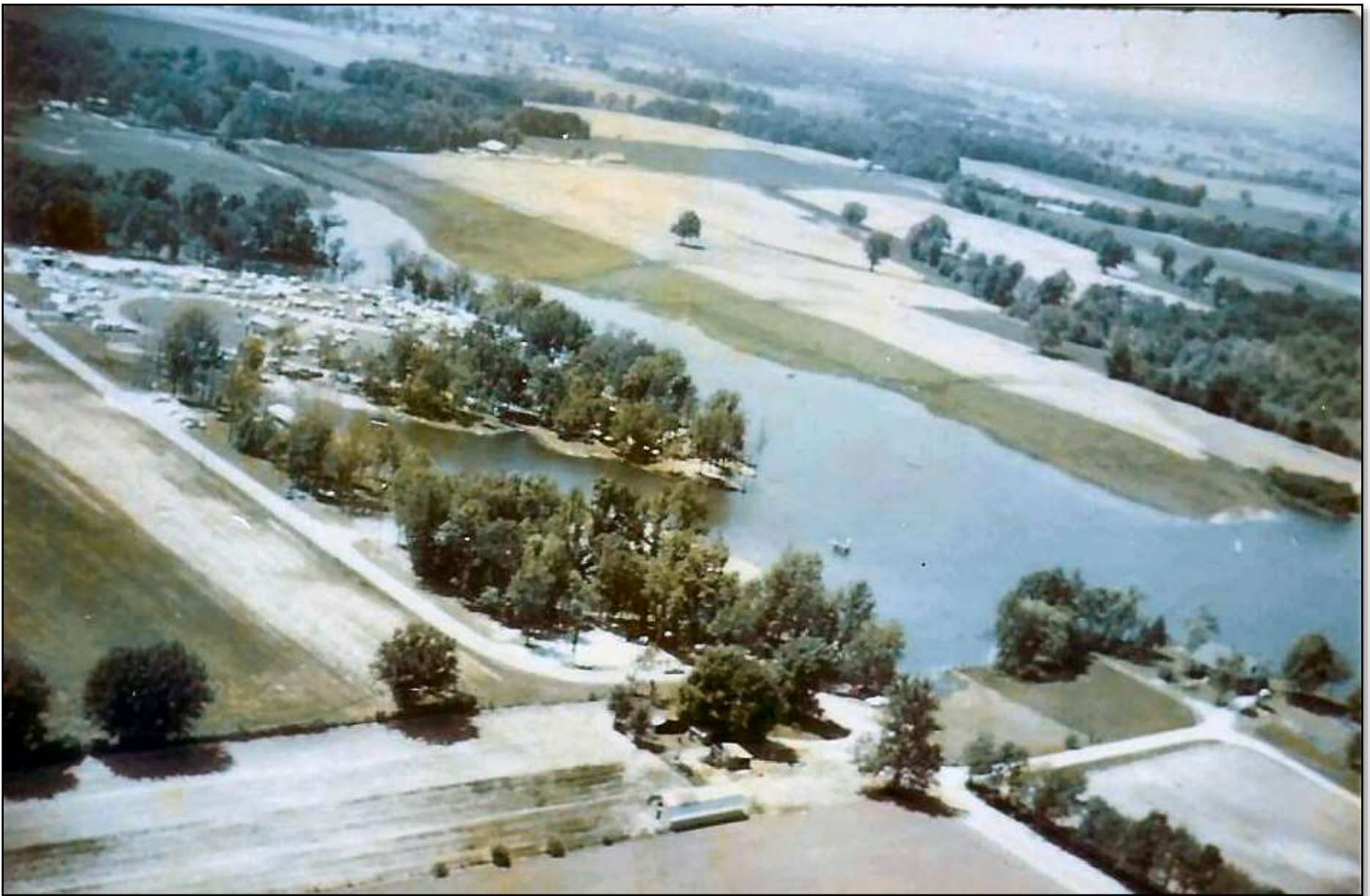
Aerial View of Campgrounds/Park/Lake: This view is looking from the east looking North West. At the bottom of the picture Louie Clements home was still on the corner and the Grannan house on the point of the lake was still there. This is a good view of the 26 acre Indian Rock Lake. It appears CR 100 N. heading towards Cannelburg was still a rock road. It was a mud road until 1964-65 time frame and them blacktop for part of the way in the 70's.