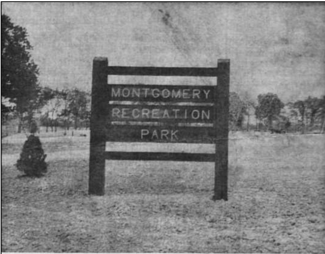
THIS SIGN announces the entrance to the Montgomery Recreation Park, which is located on the northeastern edge of